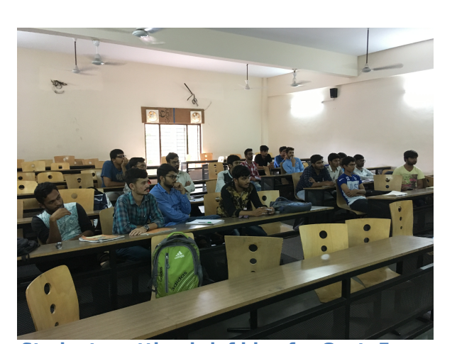
Students getting brief idea for Govt. Exam Preparation

Objective: To Uplift students methodology regarding Government Exam Preparation.